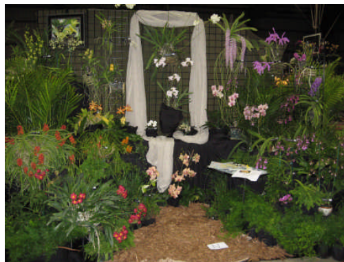
Central Florida Orchid Society's exhibit in our show won the Best Society Exhibit Award.